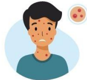
Rash with blisters on all body parts