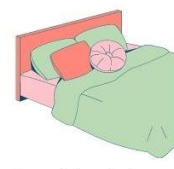
Touching infected bedding,towels, clothing etc