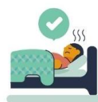
Plenty of Rest