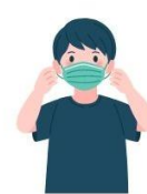
Wear Mask if you cant avoid close contact