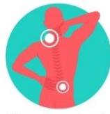
Muscle or body aches