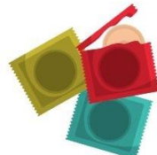
Practice Safe Sex