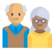
Adults above 65 years