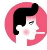
Fever/ Feverish chills