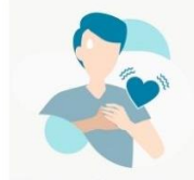
People With Chronic Illness