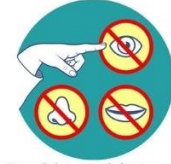
Avoid touching your eyes, nose, and mouth.