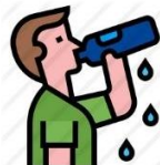
Drink Plenty of Liquids