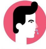
Running Nose / Nasal Congestion