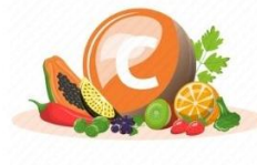
Intake Vitamin C Rich Food