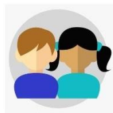
Children under Age 5