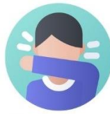
Cover coughs/ sneezes