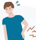
Muscle & Back pain