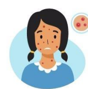
Check for symptoms before close contact