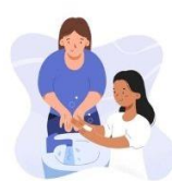
Avoid Close Contact