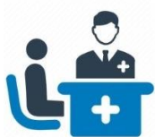
Consult a Doctor