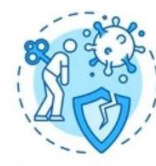
People with weak Immune System